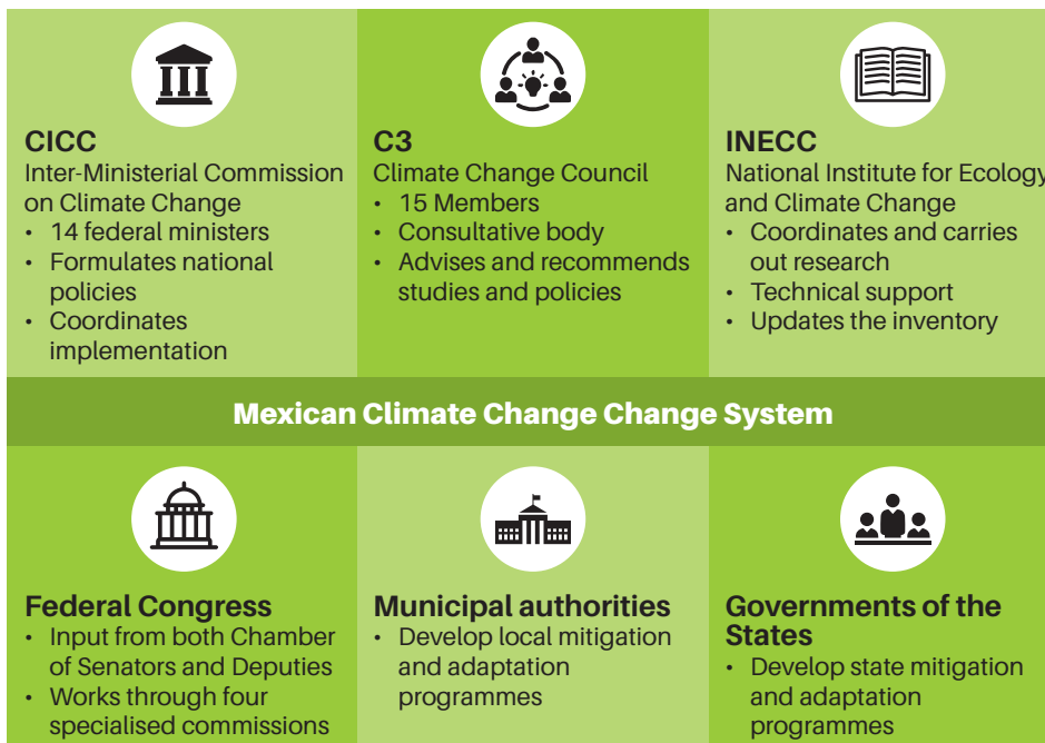
Figure 2: Mexico's national system on climate change

Mexico has set a goal of 30 percent reduction of GHG emissions by 2020 over the business as usual, and a 50 percent reduction below the year 2000 baseline level by 2050.